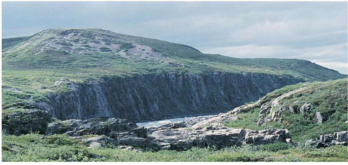
Nunavut Parks & Special Places - Editorial Series