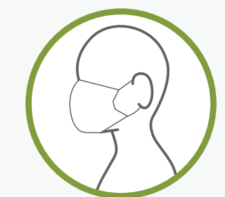
NO-SEW MASK USING A FOLDED SCARF/BANDANA AND RUBBER BANDS/HAIR TIES