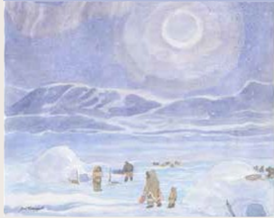
Ճեղքվածքներ ձյան տակ, ձյան տակ ձյան տակ.