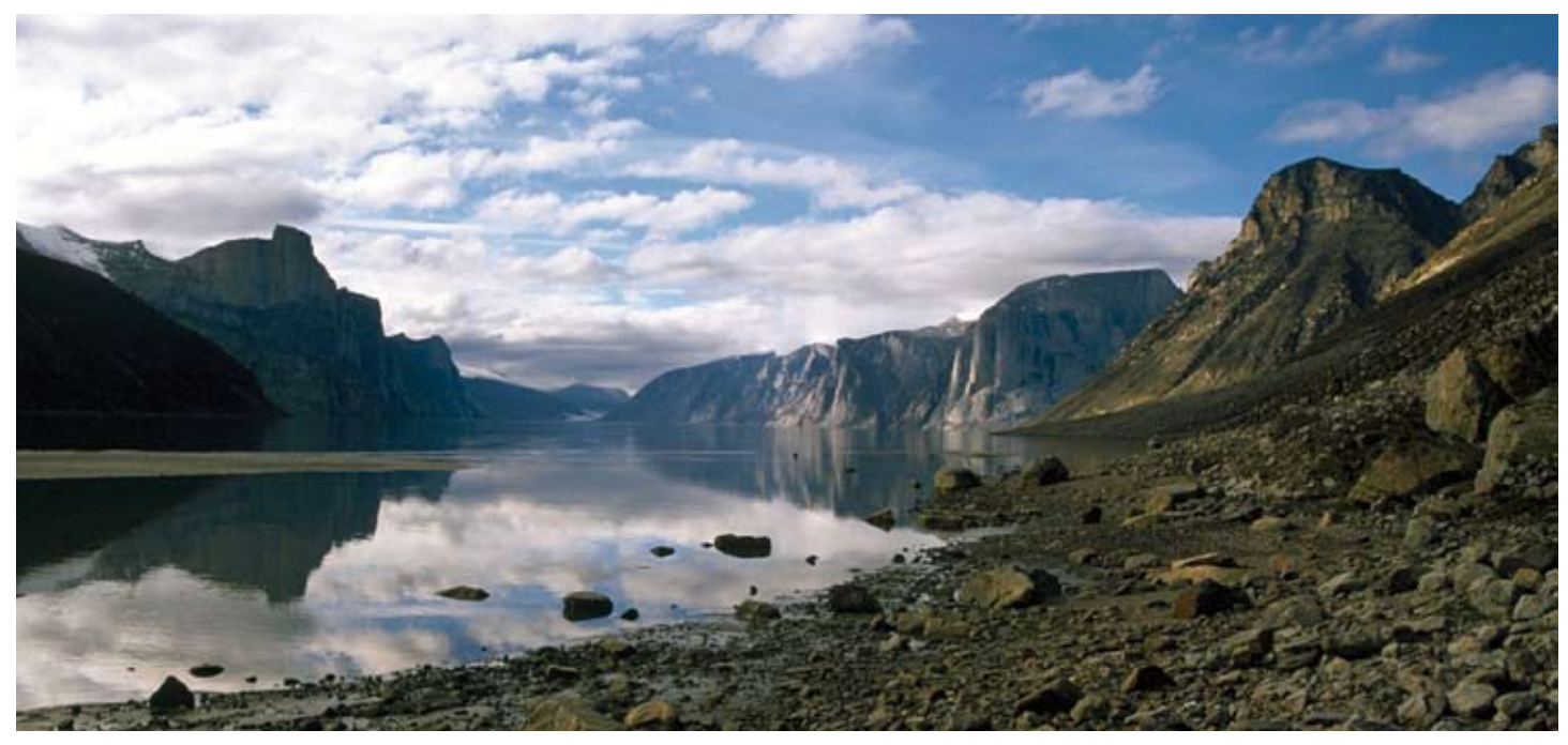
Nunavut Parks & Special Places - Editorial Series